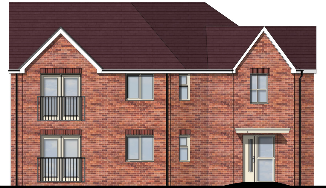
Front / Side Elevation