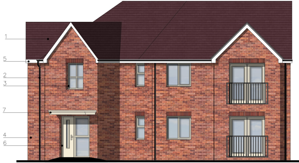
Front / Side Elevation